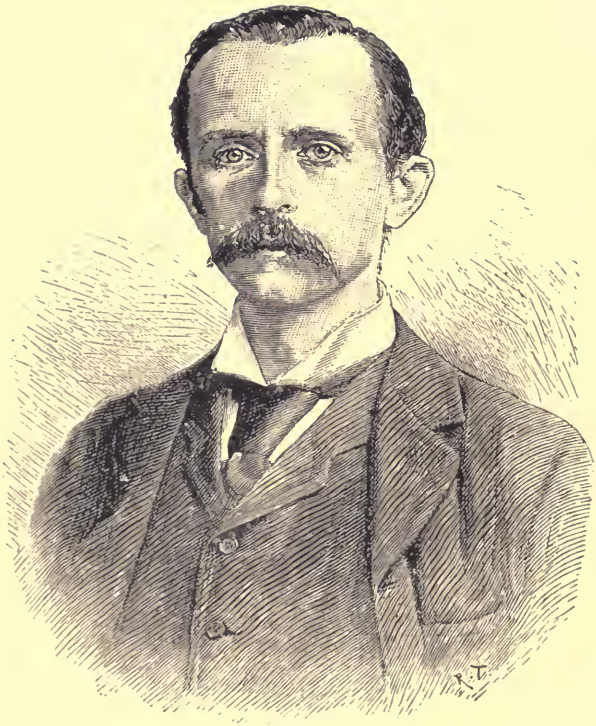
J. M. BARRIE.